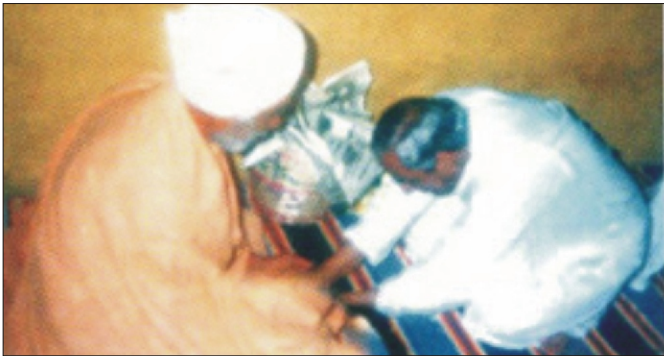
Rev. Dada J.P. Vaswani