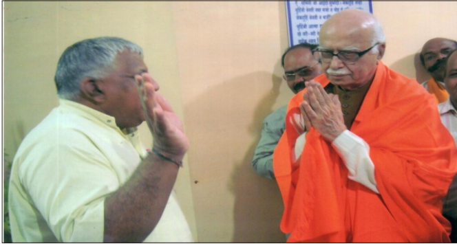
Hon'ble Shri L.K. Advani