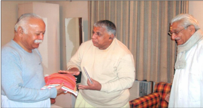
Hon'ble Shri Mohan Bhagwatji | Shri Ashok Singhalji Sarsanghchalak, RSS | International Working President, VHP