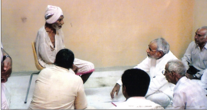
Hon'ble Shri Narendra Modiji