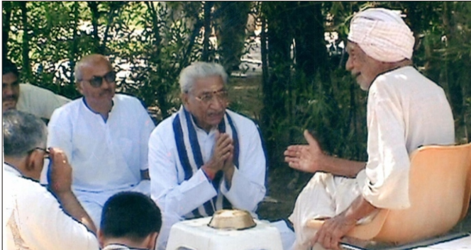
Hon'ble Shri Ashok Singhalji