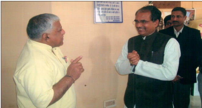
Hon'ble Shri Shivraj Singh Chouhanji Chief Minister, M.P.